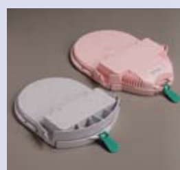
Pad-Pak™ and Pediatric-Pak™, with pre-attached electrodes

Low cost of ownership. Cartridge typically has a shelf-life of 3.5 years from date of manufacture, offering significant savings over other defibrillators that require separate battery and pad units.